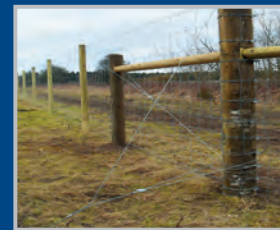
Support fence posts using a Gripple Anchor