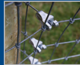
Terminate at an end post with a Gripple T-Clip