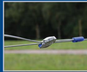
Join and tension wire using a Gripple Plus