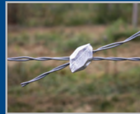
Join and tension barbed wire using Gripple Barbed