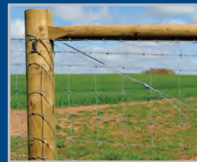
Brace H-Posts with a Gripple Bracing kit