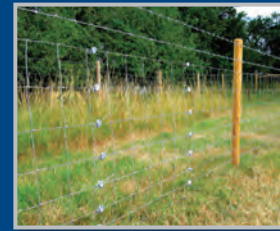
Install and repair field fence with Gripple Plus